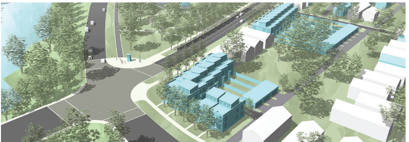
FALL CREEK & WATKINS PARK TOWNHOMES